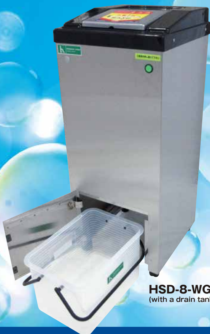
HSD-8-WGS (with a drain tank)