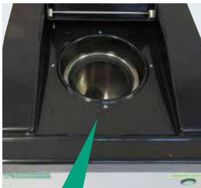
Water extraction basket