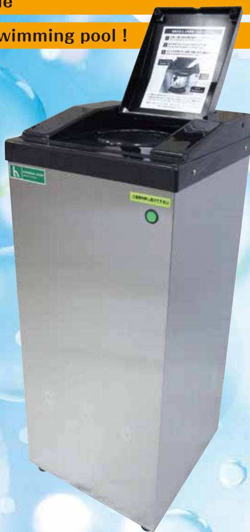
HSD-8-WHS (direct to a drain)